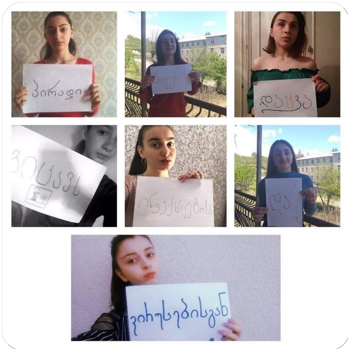
Momavlis Taoba (Future Generation) students prepared posters on the importance of maintaining good hygiene during the COVID-19 pandemic and shared them via Facebook

the topic via Zoom. The debates have been met with much success with the youth enjoying this form of interaction with the police officers. Georgia's Schools, Community, & Police Engagement Program (SCOPE) has been able to lead legal culture classes online. The SCOPE program has created a virtual tour of a court building as well as an innovative educational online game called "The Police Officer", which aimed to build trust between youth and police in Georgia. Georgia's Momavlis Taoba (Future Generation) civic education program has been hosting live Facebook webinars, including a webinar with the director of USAID's Democracy, Governance and Social Development Office which received more than 290 comments and questions and has reached over 8,000 viewers and a webinar with the Executive Director of Transparency International Georgia which had over 2,300 viewers and more than 300 live questions and comments from students and civics teachers.